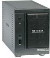
Convenient, small size for desktop use (~ 6 x 4 x 9 in)